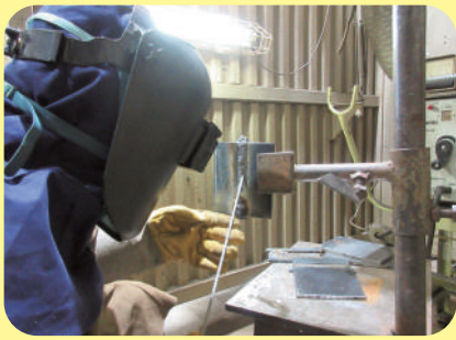
Shielded Metal Arc welding