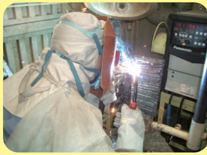
CO 2 -MAG welding