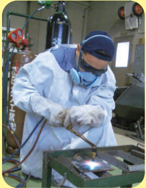
Gas cutting & welding