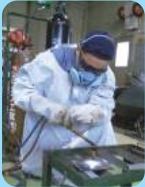
Gas cutting & welding