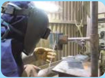
Shielded Metal Arc welding