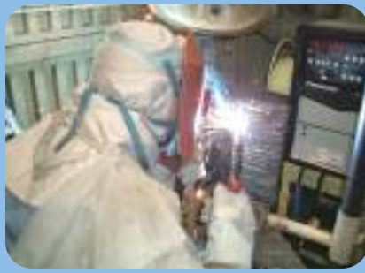
CO 2 •MAG welding