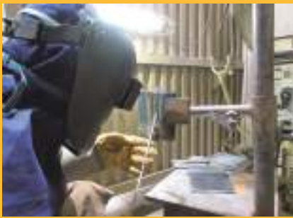
Shielded Metal Arc welding