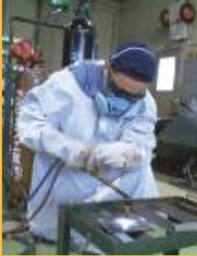
Gas cutting & welding