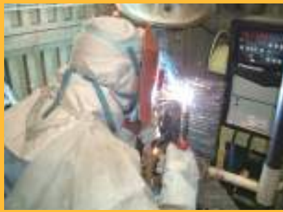
CO 2 -MAG welding