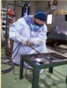
Gas cut & welding