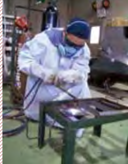
Gas cut & welding