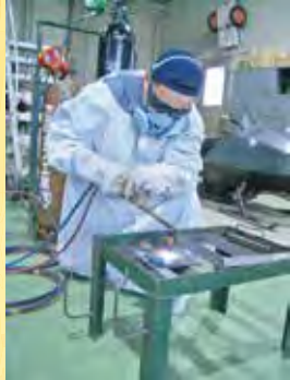
Gas cut & welding